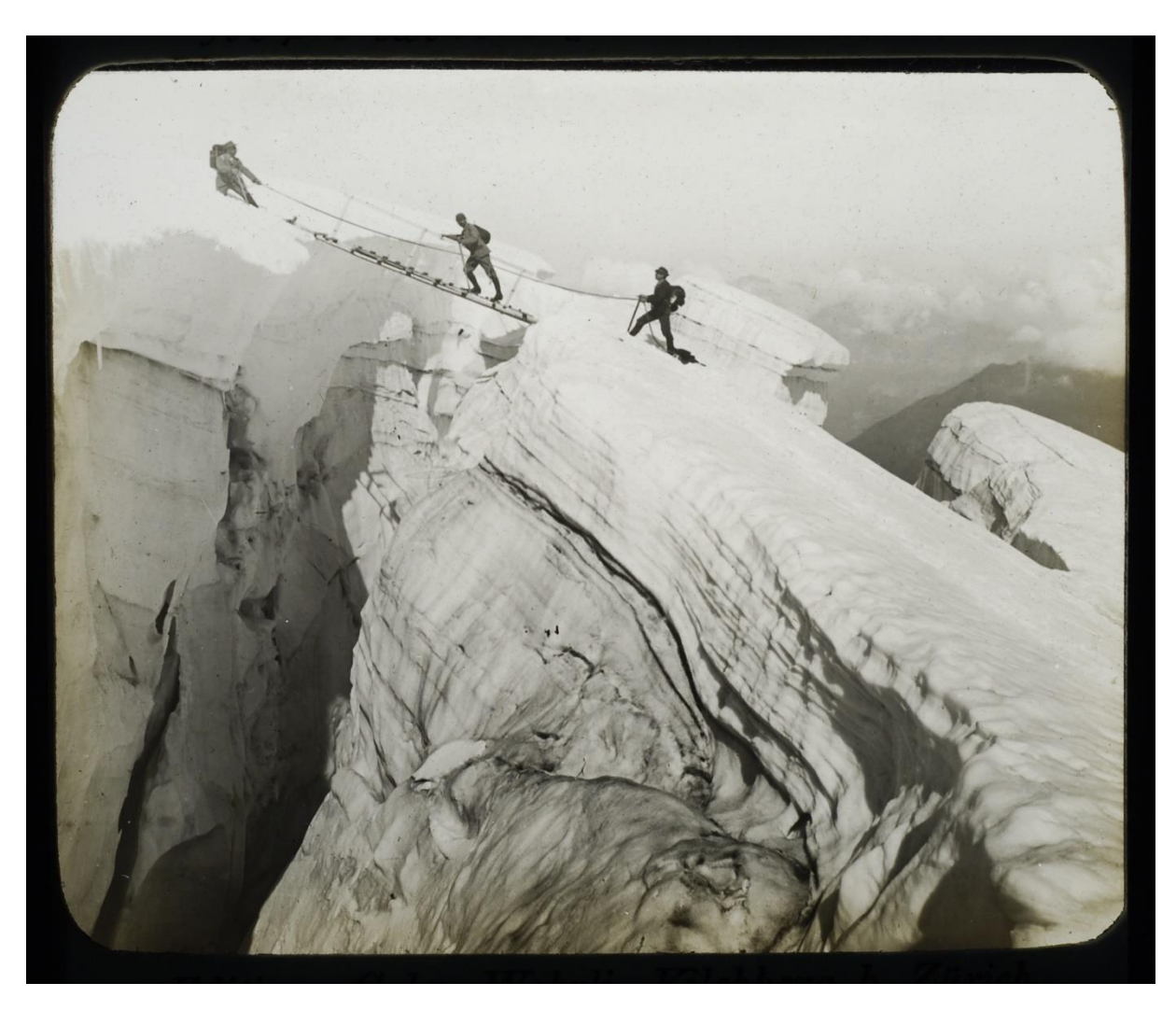
Press kit Downloadable from <a href="https://www.cameramuseum.ch">www.cameramuseum.ch</a>

Gilbert Hovey Grosvenor (1875-1966), Three climbers crossing a crevasse on Mont Blanc, ca. 1891-1904, magic lantern slide, © Musée suisse de l'appareil photographique, Vevey