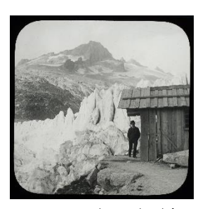
Anonymous, Glacier du Rhône and Gerstenhorn, date unknown, magic lantern slide, © Musée suisse de l'appareil photographique, Vevey.