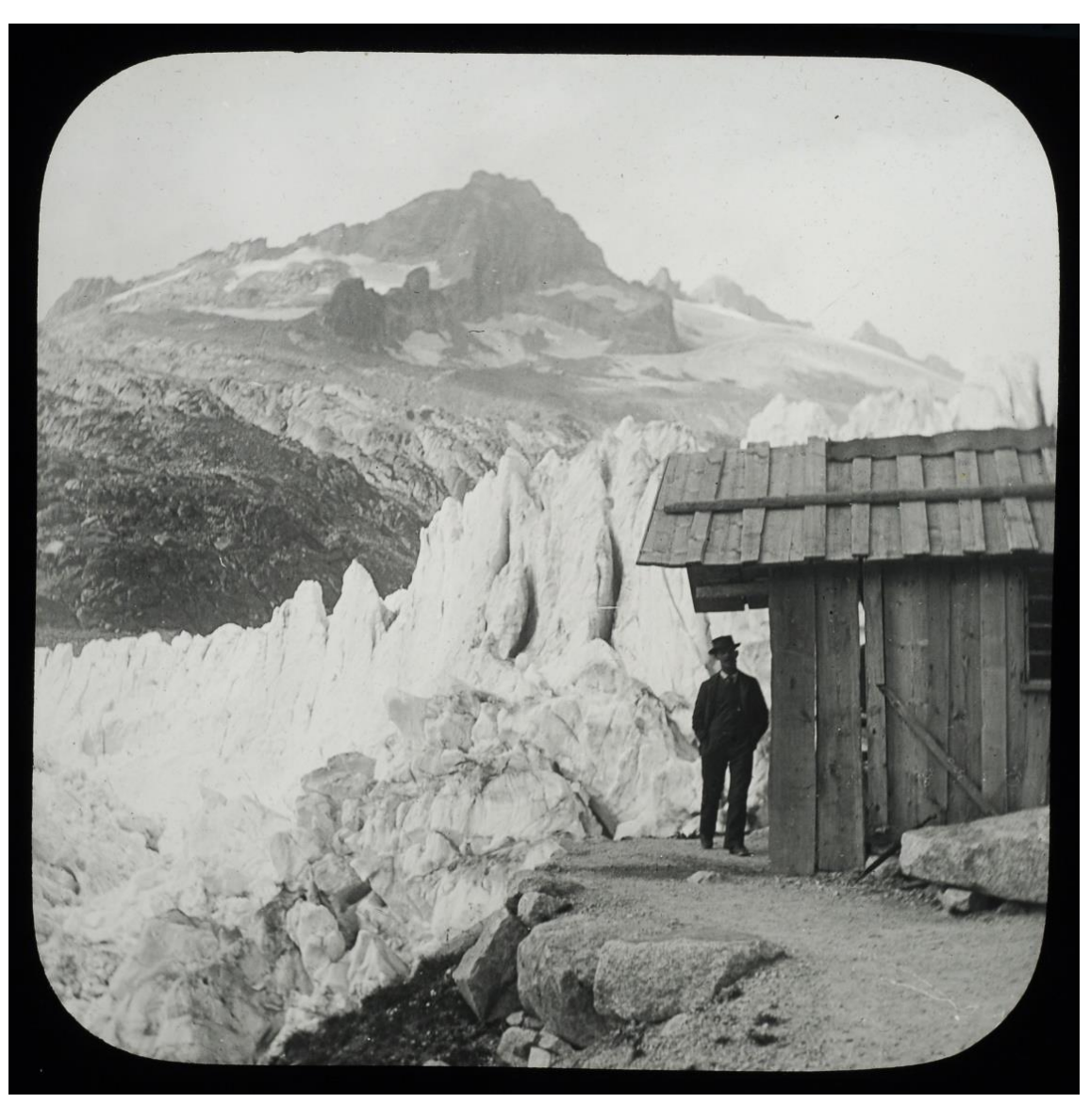
Anonymous, Rhône Glacier and Gerstenhorn, date unknown, magic lantern slide, © Musée suisse de l'appareil photographique, Vevey.

As part of the International Year of Glaciers' Preservation, proclaimed by UNESCO for 2025, the Swiss Camera Museum is presenting a double exhibition dedicated to the preservation of these giants of ice. The first part brings together phototypes from the museum's rich collections, highlighting its role in preserving this unique visual heritage. Outside the walls, on the Quai Perdonnet, the second part brings together contemporary photographs of Alpine glaciers covered in insulating tarpaulins, a measure designed to slow their melting. Assembled by Nathalie Dietschy (UNIL), this unprecedented body of work reveals the diversity of artistic and scientific perspectives on these changing landscapes, offering a striking reflection on the issues involved in protecting them.